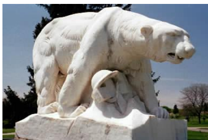
The Polar Bear Monument (above) is located within White Chapel Cemetery, Troy, MI. It was dedicated on May 30, 1930.