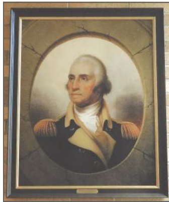
Swartz Creek View

The Rembrandt Peale gift portrait of General George Washington was the focus of the celebration. Swartz Creek High School is now the proud recipient of one of about